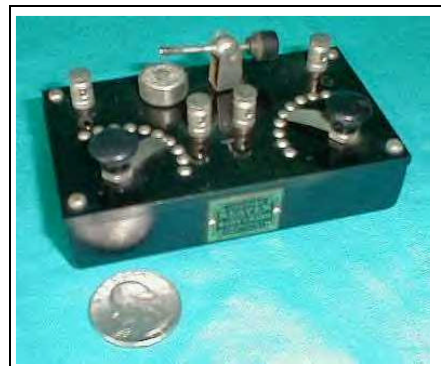
The Beaver Baby Grand— note its similarity to the set in the "clock radio."