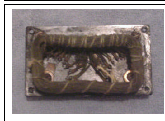
Interior of "clock radio" showing multi-tapped coil. With no antenna tuning, this set is designed to receive only a limited number of nearby stations.