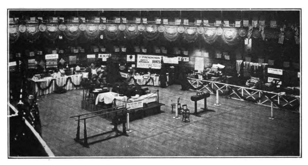
BLIND WORKERS' EXHIBITION, METROPOLITAN OPERA HOUSE, NEW YORK Looking toward the boxes

A most important part of the activities of all organizations devoted to the welfare of the blind is to arouse the public to a realization of their capabilities. The Blind Workers' Exhibition did much to stimulate this very interest. The many columns of widely circulated newspaper stories in themselves justified the hard work this extensive publicity campaign entailed upon the initiators of the project and upon their friends and coöperators.