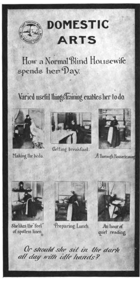
One of the 78 charts (8 ft. x 4 ft.) prepared by the New York Association for the Blind

May the good and generous people of New York, who are appealed to to support so many good causes, add to their list of